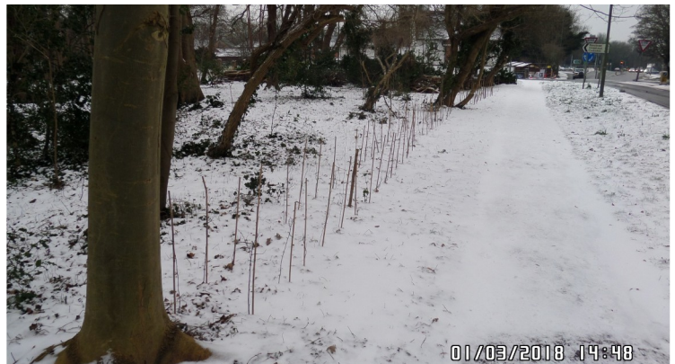
'The beast from the east strikes'

We have been given a wildflower seed kit from the GROW WILD team at Kew Gardens. These seeds will be sown into the open area fronting onto Bolters Lane and the mini roundabout. We would also like to try and plant some of these seeds and grow them onto 'plug plant' stage. This will increase the likelihood of producing successful full size plants. Are there any volunteers with greenhouses who would like to help us with this? If so please contact me at brian.bvra@gmail.com