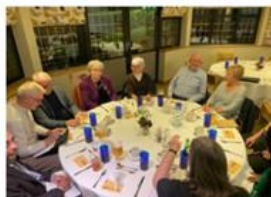
Meeting over Dinner at Cuddington Golf Club

If Rotary sounds like the organisation for you and you feel like volunteering some of your spare time, we'd like to hear from you!