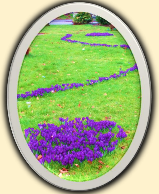
Photo: The library planting with the Beacon School some years ago